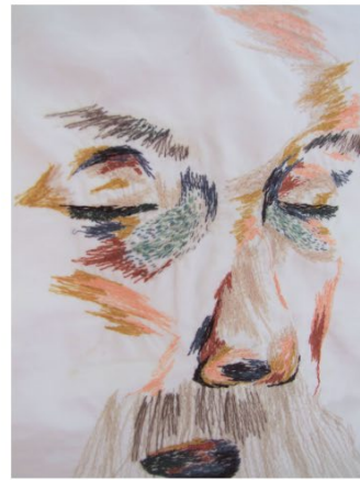
Un Cerf er Wires